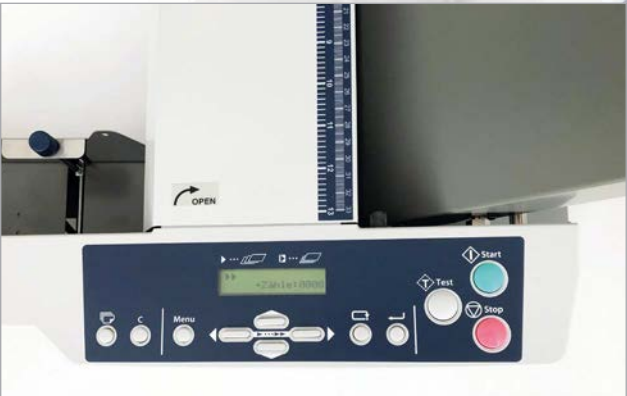
Easy to use interface.