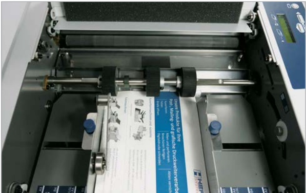
Fine adjustment on crease or parallel fold.