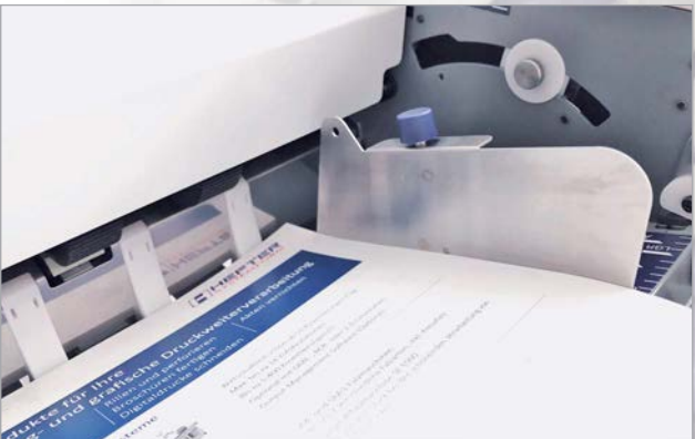
500 sheet feeding tray with the ability to count and pause job.