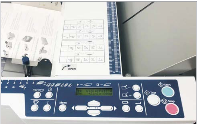
Scroll through menu for easy operator use.